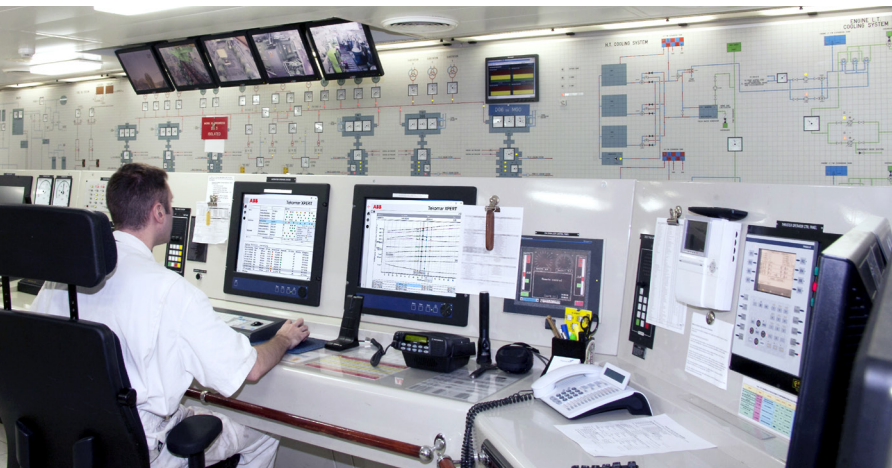
ABB Ability™ Tekomar XPERT software provides an instant diagnosis of engine performance, with advice to reduce fuel costs and the environmental footprint of a fleet. Each day, XPERT offers fuel savings of up to 3 tons and financial savings of up to $1000 per vessel. XPERT also saves 2-3 hours of analysis time per engine.

— Tekomar XPERT control room — 01 Tekomar XPERT offers instant savings for optimal fleet performance in the long term.